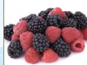
Organic Raspberries or Blackberries Page 3