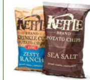
Kettle Brand Potato Chips Page 2

Prices valid June 27 - July 10, 2012 While supplies last