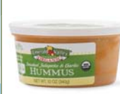
Emerald Valley Salsa or Hummus Page 4