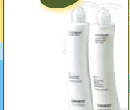
Giovanni Body Care Page 7