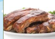
Beeler's St. Louis Style Ribs Page 5