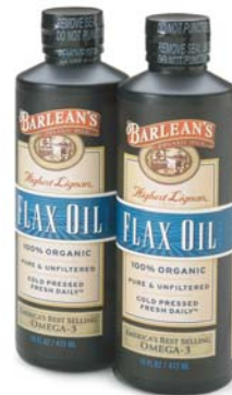
Barlean's Flax, Fish or Coconut Oil

Essential omega fatty acids for men or women Selected varieties & sizes