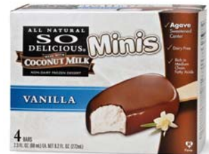
So Delicious Non-Dairy Frozen Desserts

Selected varieties & sizes Additional selections & sizes, $4.69