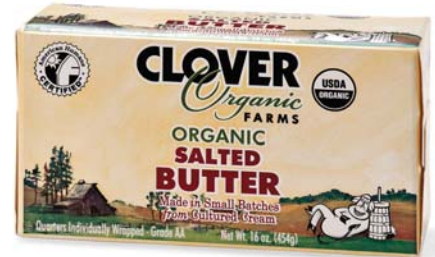
Clover Organic Farms Organic Butter Salted or Unsalted varieties - 16 oz.