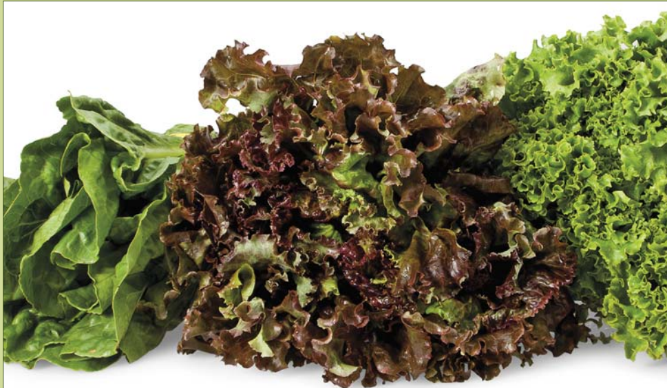
New Frontiers Organic Red, Green or Romaine Lettuce Crisp, tender leaves - Wonderful in salads or sandwiches