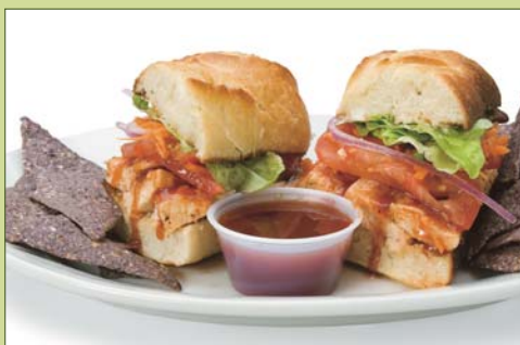
Made fresh in our deli Barbecued Chicken Sandwich Roasted chicken, home-made barbecue sauce and veggies on a fresh baked demi-loaf