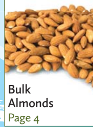
Bulk Almonds Page 4