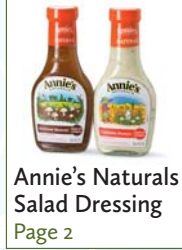
Annie's Naturals Salad Dressing Page 2

Prices valid June 26-July 9, 2013 While supplies last