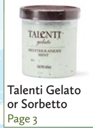
Talent Gelato or Sorbetto Page 3