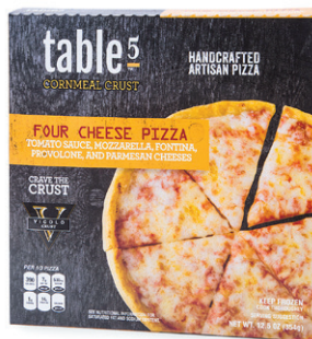
Table 5 Pizza