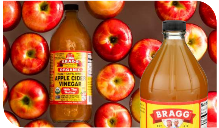
Bragg Organic Apple Cider Vinegar