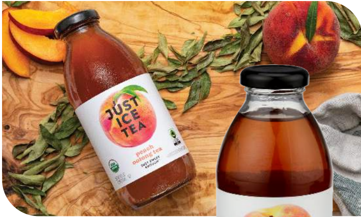
Just Ice Tea Organic Ice Tea (selected varieties)