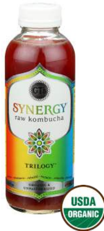
GT's Organic Kombucha (selected varieties)