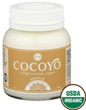
GT's Organic Coconut Yogurt (selected varieties)