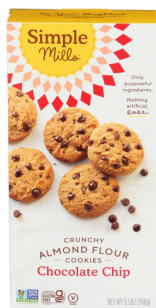
Simple Mills Gluten Free Cookies selected varieties

Simple Mills is driven by our mission to make products that go beyond "free from" to "for more." Our products include more of what we want: purposeful, nutrient-dense, delicious ingredients, and nothing artificial, ever.