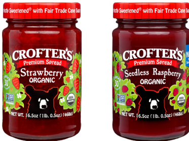
Crofter's Organic Organic Premium Fruit Spread selected varieties

Dive into deliciousness with Crofter's Organic! Bursting with fruit and 1/3 less sugar than traditional jam. Elevate any dish with our spreads—just 5 wholesome ingredients per jar. Spread joy, spread yum!