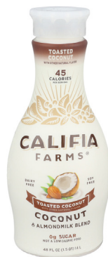
Califia Farms Almondmilk selected varieties