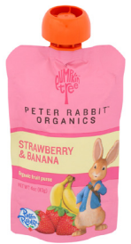
Peter Rabbit Organics Organic Baby Food Pouch selected varieties