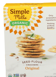
Simple Mills Organic Seed Flour Crackers selected varieties