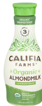
Califia Farms Organic Almondmilk