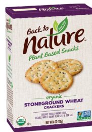
Back to Nature Organic Crackers selected varieties

We carefully select our ingredients to create great-tasting cookies and crackers that you can enjoy all day long.