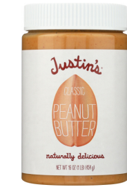
Justin's Peanut Butter selected varieties