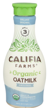
Califia Farms Organic Oatmilk