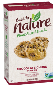
Back to Nature Cookies selected varieties