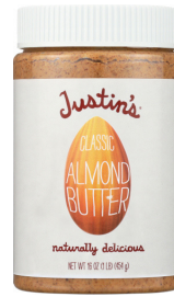
Justin's Almond Butter selected varieties