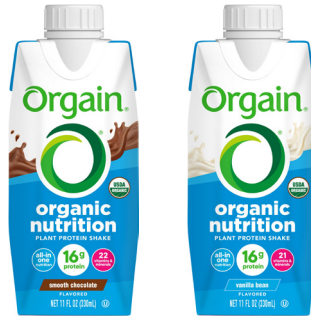
Orgain Organic Vegan Nutritional Shake selected varieties