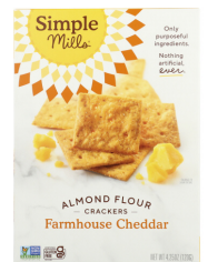
Simple Mills Almond Flour Crackers selected varieties