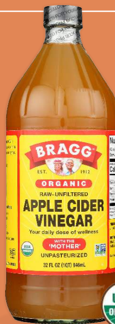
Bragg Organic Apple Cider Vinegar