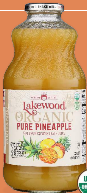
Lakewood Organic Pure Pineapple Juice